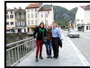
Abbaye de Lagrasse