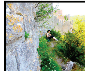
Grottes de Niaux